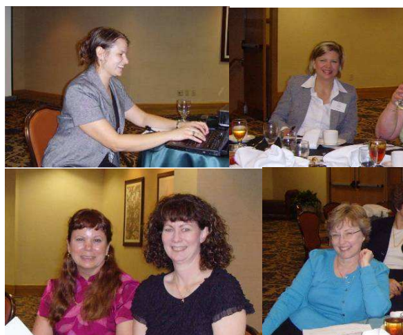
Everyone learning about Facebook

After our meeting we also had a quick tutorial on Facebook. Search for AWSCPA Houston on Facebook to become our friend.