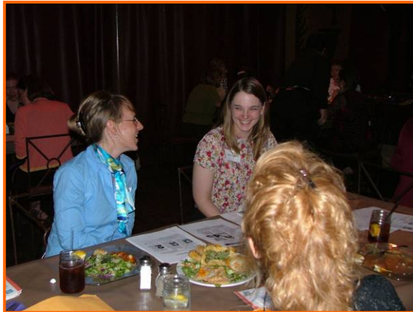
Photos from 2005 Fall Fiesta at El Charro Restaurant